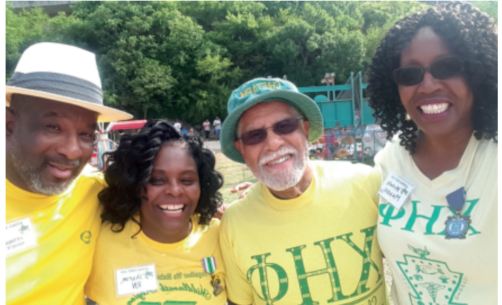
Taste of New Orleans

Theta Eta Chapter volunteered to manage the First Aid Stations for Taste of New Orleans April 20-22, 2018, a 3-day festival sponsored by the San Antonio Zulu Association/SAZA Commission Inc. The organization reaches out to the community by providing youth the opportunity to further their education through scholarships.