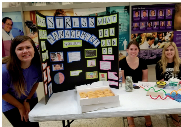
Lambda Eta Alpha Beta candidates at May event

The candidates for membership discussed Mental Health Awareness with students, faculty, and staff in support of Month on April 30, 2018. Donations received from the TCU Wellness Center included stress balls, brochures, and pamphlets. A poster display was included in the discussion sessions. The title of the program: May is Mental Health Awareness Month "Donut" Stress . Donuts were provided along with the information.