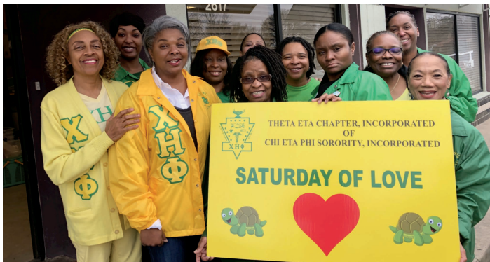
Saturday of Love