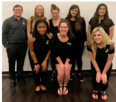
Lambda Eta Alpha Beta Line

Lambda Eta Alpha Beta had eight candidates on their last line.